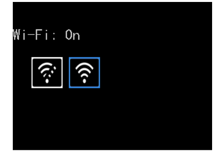
Figure 3. 1 Wi-Fi Settings

2. Press \Delta/\nabla to position the cursor on Wi-Fi item. And press - to enter Wi-Fi menu.