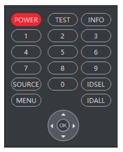
Figure 2-1 Virtual Remote Control

You can use Remote Control in the lower left corner of the client interface to control the display(s).