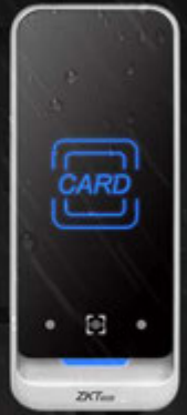
QR600 - V