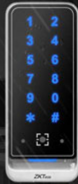
QR600 - VK